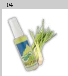
Organic Lemongrass Spray 天然香茅精油