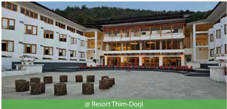
@ Resort Thim-Dorji