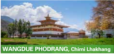
WANGDUE PHODRANG, Chimi Lhakhang