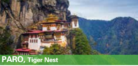
PARO, Tiger Nest