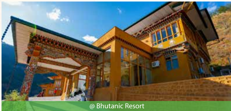
@ Bhutanic Resort