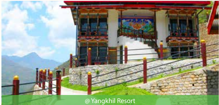
@ Yangkhil Resort