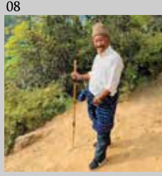
Hiking Stick at Tiger Nest 虎穴寺的登山杖