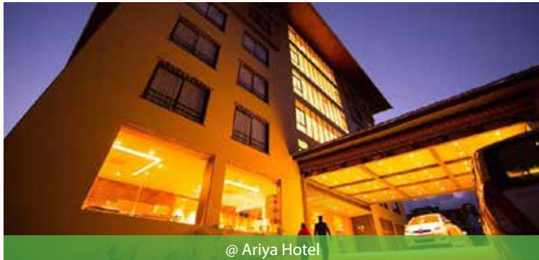
@ Ariya Hotel