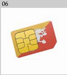
Local Data Sim Card 3GB 3GB网络电话卡