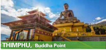
THIMPHU, Buddha Point