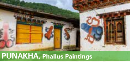
PUNAKHA, Phallus Paintings