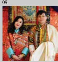
Bhutanese Costume Experience 不丹传统服装