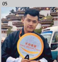
English, Chinese Speaking Guide 中英导游讲解