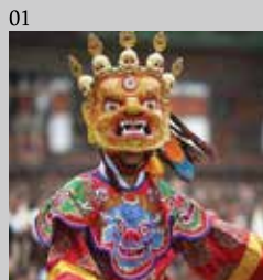
Bhutanese Cultural Dance 不丹文化舞蹈表演