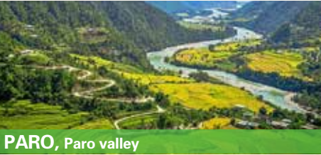
PARO, Paro valley